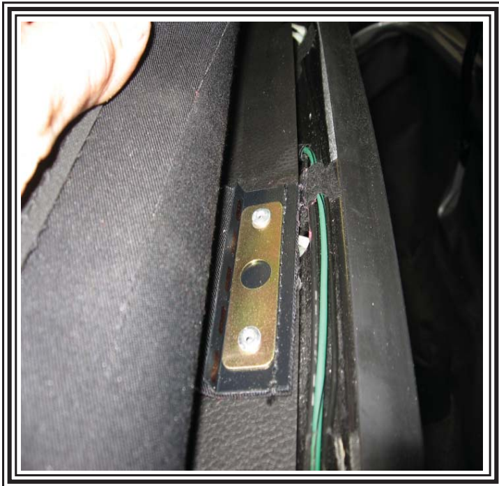
The flaps and top below the window are pop riveted down to the plastic cover using the original metal plate.