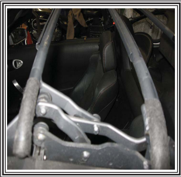
Remove elastic straps from the bows.