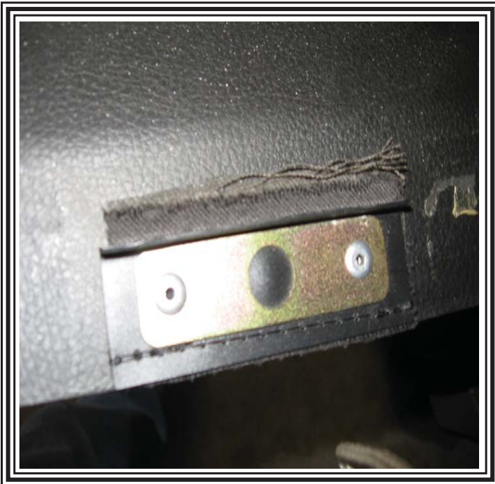
This is a view of an old top, it always tears loose and frays in this area. Take off metal plates from the plastic covers.