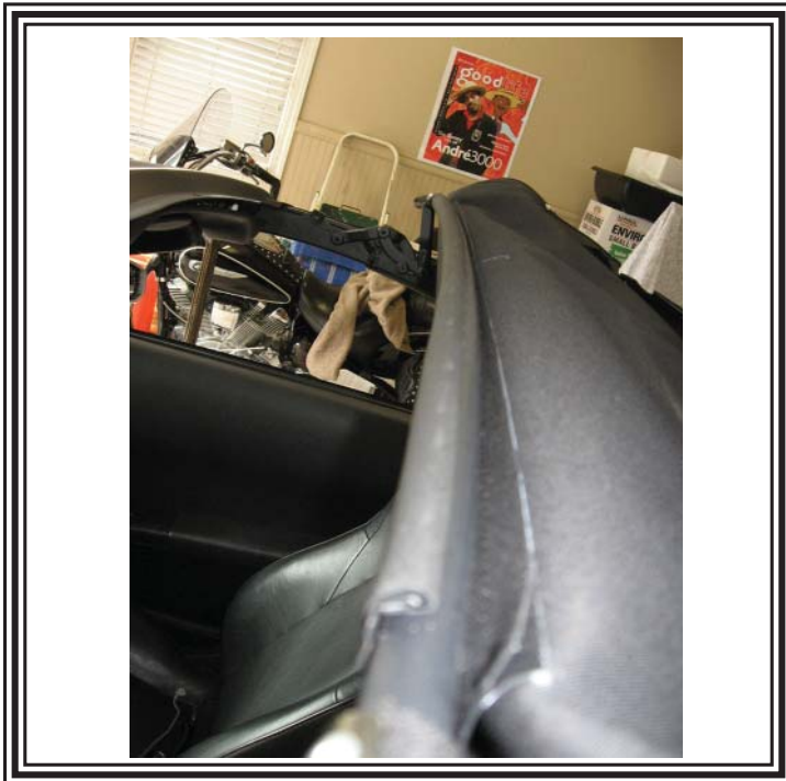
A close up view of the front bow.