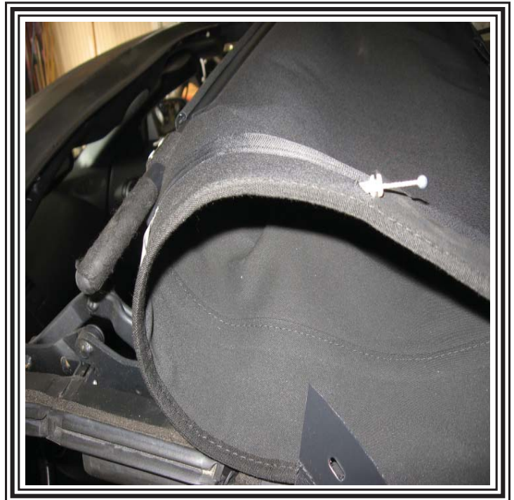
Pass the side cables through both the drivers side and passengers side of the top.