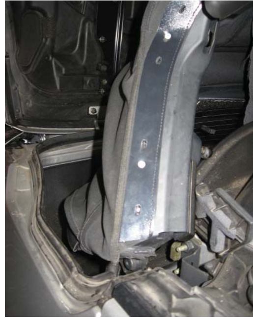
This view shows the installation of the channel flap on the passengers side of the frame.