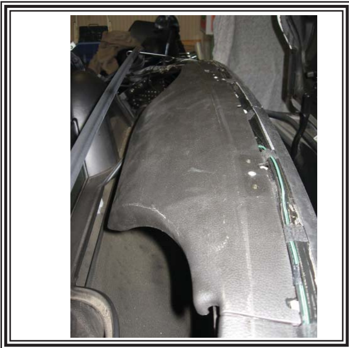
This is a closer view of the plastic cover reinstalled.