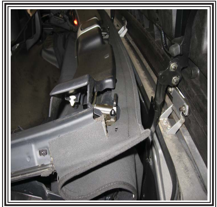
Fasten the front of the top to the front of the header bow.