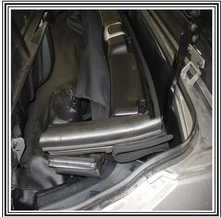
Reinstall both the passenger and drivers side weather strips.