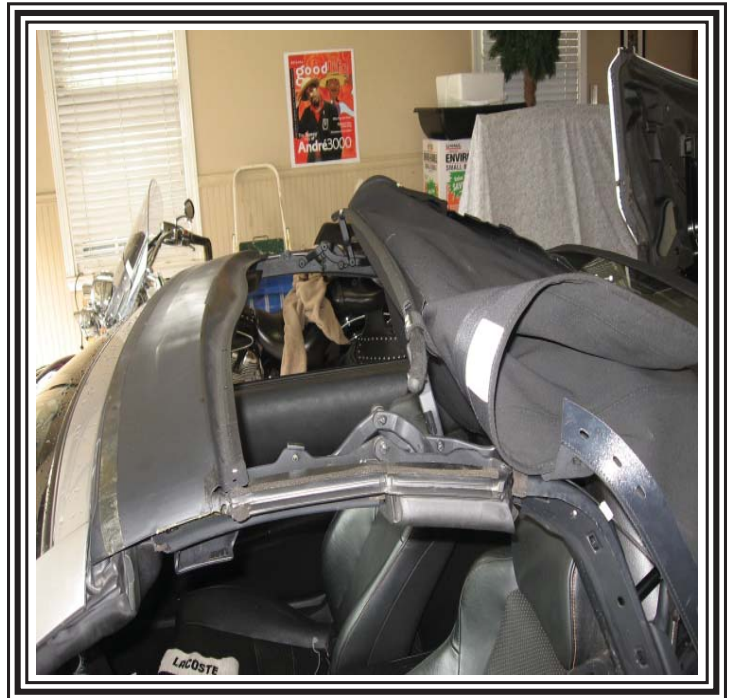
Fasten the top bow listing to the front bow of the frame.