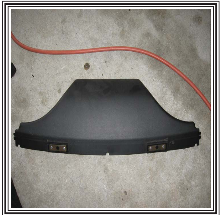
View of the plastic cover.