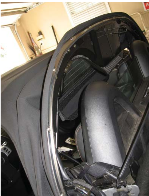
Fasten or secure the back of the top to the back of the frame. Next reinstall the weather strips to the back of the frame.