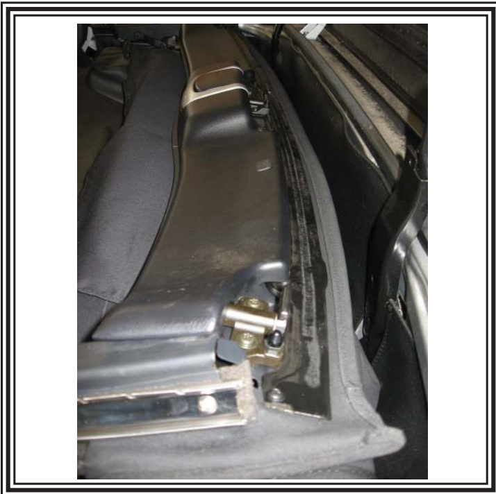
Reinstall the metal plate back on the front of the header bow.