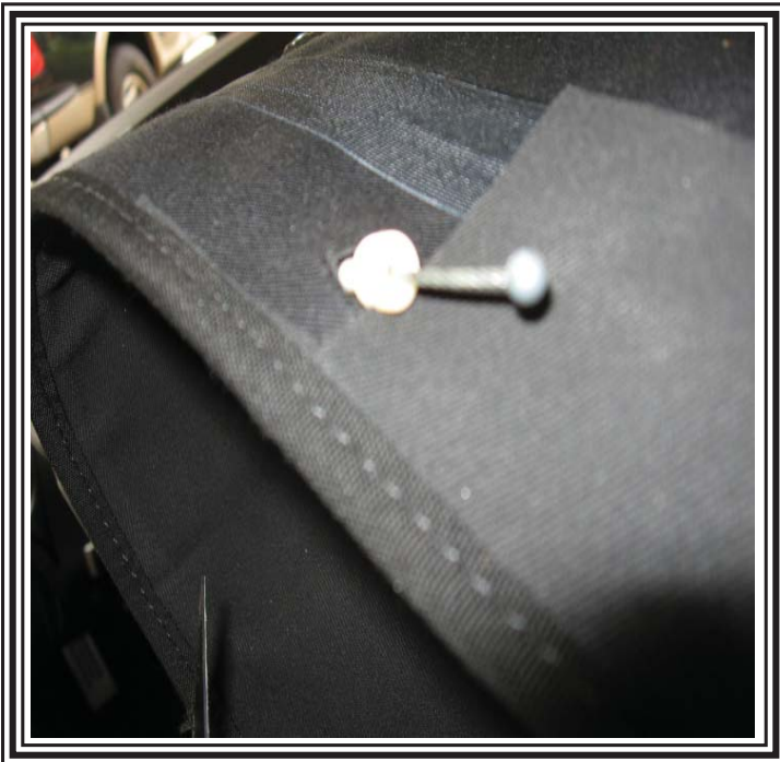
This is a close up view of the side cable exiting the front of the top.