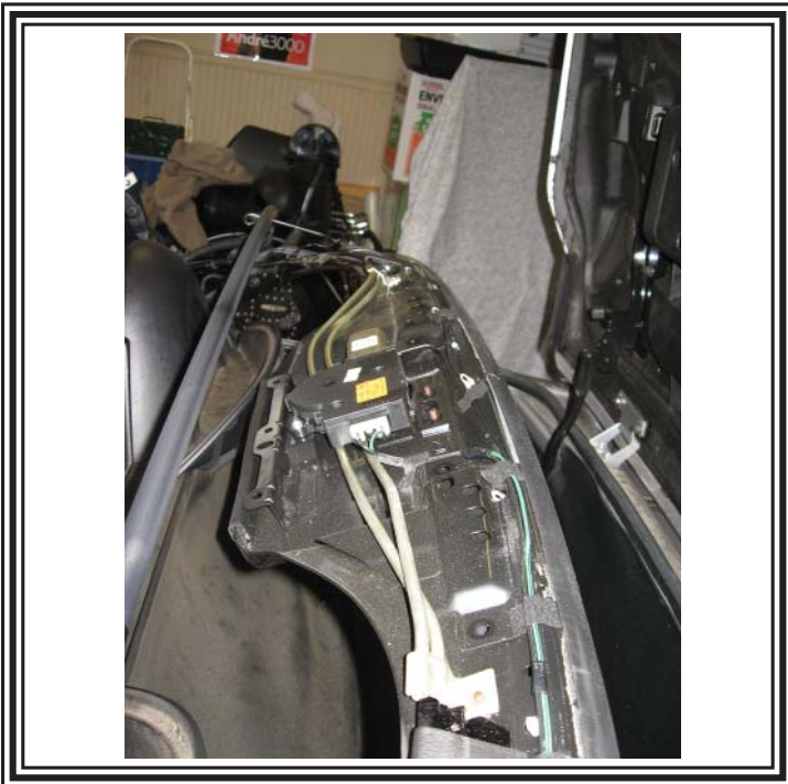
Remove plastic cover from the back of the top frame.