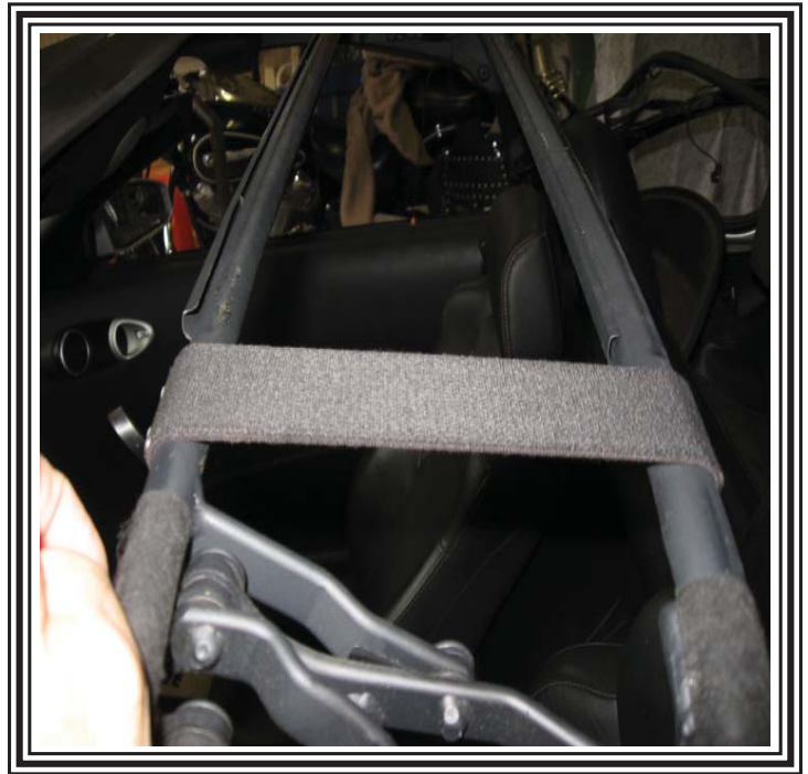
Install new elastic straps to the bows.