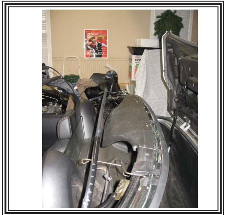
Reinstall the plastic covers.