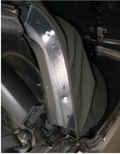
Fasten the rear channel flaps to the front of the C pillar post behind the quarter glass windows. This view is of the drivers side of the frame.