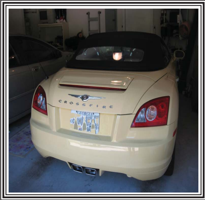
The finished top.