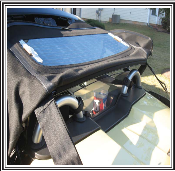
This is a picture of the top after sliding the bow listings into the channels of both top bows.