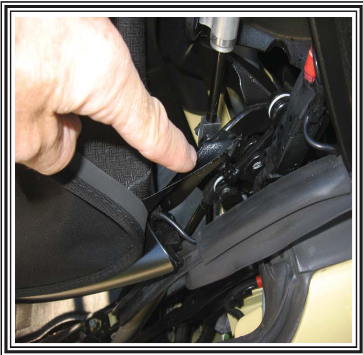
Pop rivet another strap at the bottom of the quarter to the frame (location shown )above.