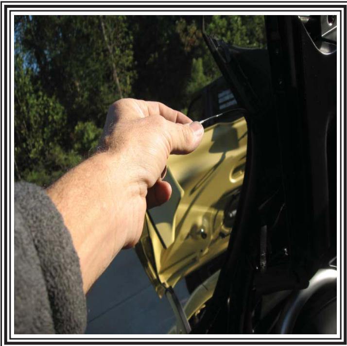
This is a picture of the cable at a different angle.