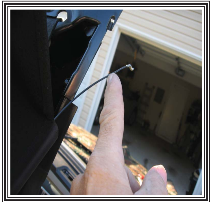
Slide the side cables through the sleeves on each side of the top. Attach the cable to the front of the header bow on both sides of the frame.