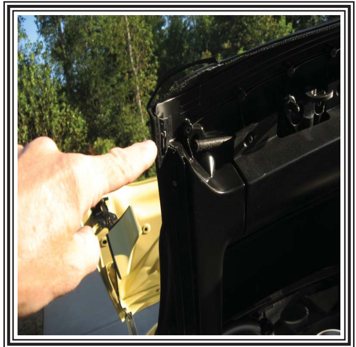
Lock both the plastic pieces on both sides of the header bow and then install a pop rivet to keep it secure.