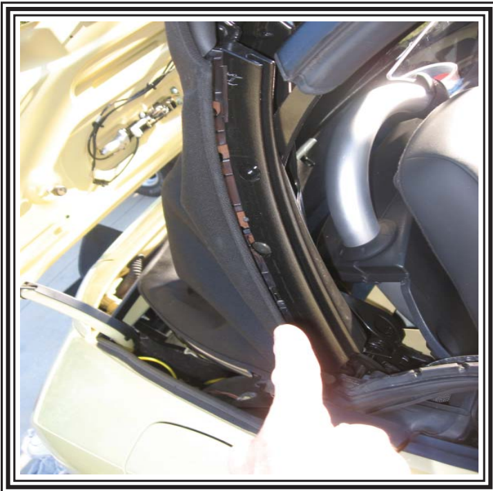
This is a picture of the quarters of the top locked in at a different angle.