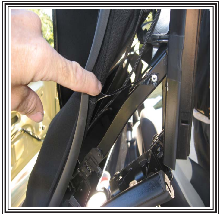
Pop rivet the strap on the side of the frame strut on each side of the frame.