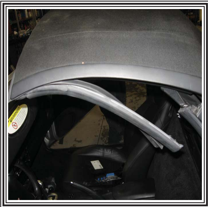
You then need to secure the weather strip retainer to the frame and then lock in the weather strip