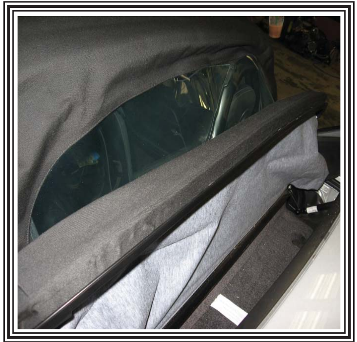
This is a view of the left side.