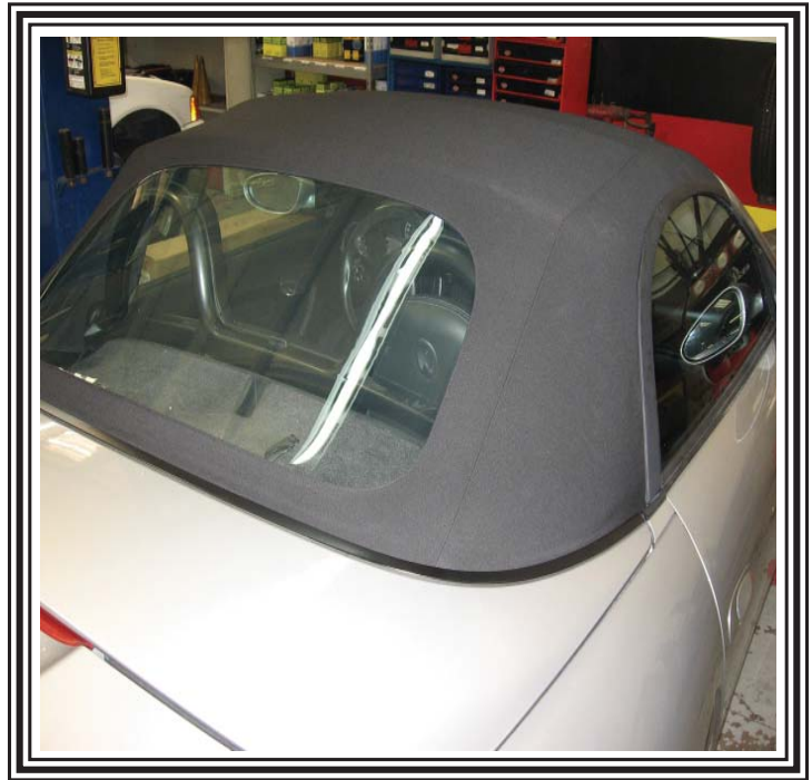
The finished top (a rear quarter view.)