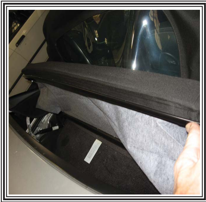
In this picture of the previous page the flap and the frame are glued together. This is the view from the right side.