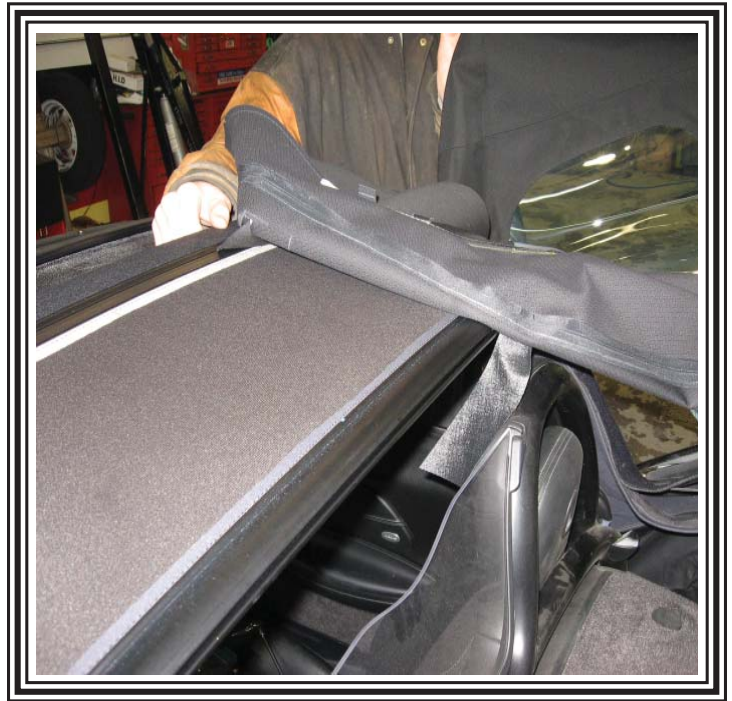
Slide both bow listings through the top frame.