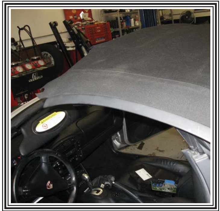
This is a picture of the metal plate secured to the frame.