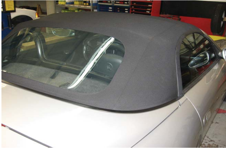
1997-02 Porsche Boxster PO 7760 Top GR11 Blk/Blk Sonnenland Material

Always Check Stock # and Color Before Starting Installation