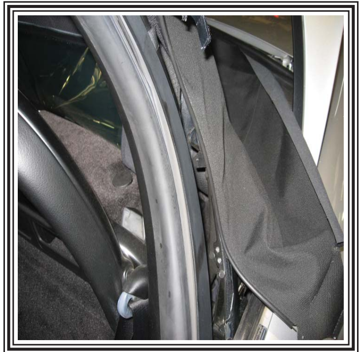
This picture shows a view of the previous view completed with the flap in place.