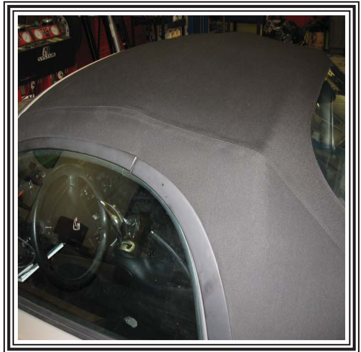
Drivers side view of the finished top.