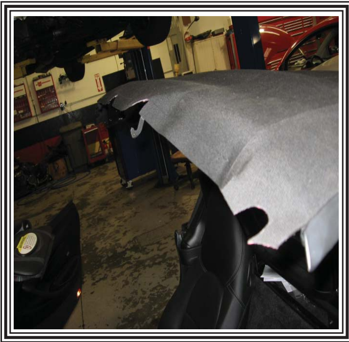
Glue the front of the top to the front of the frame.