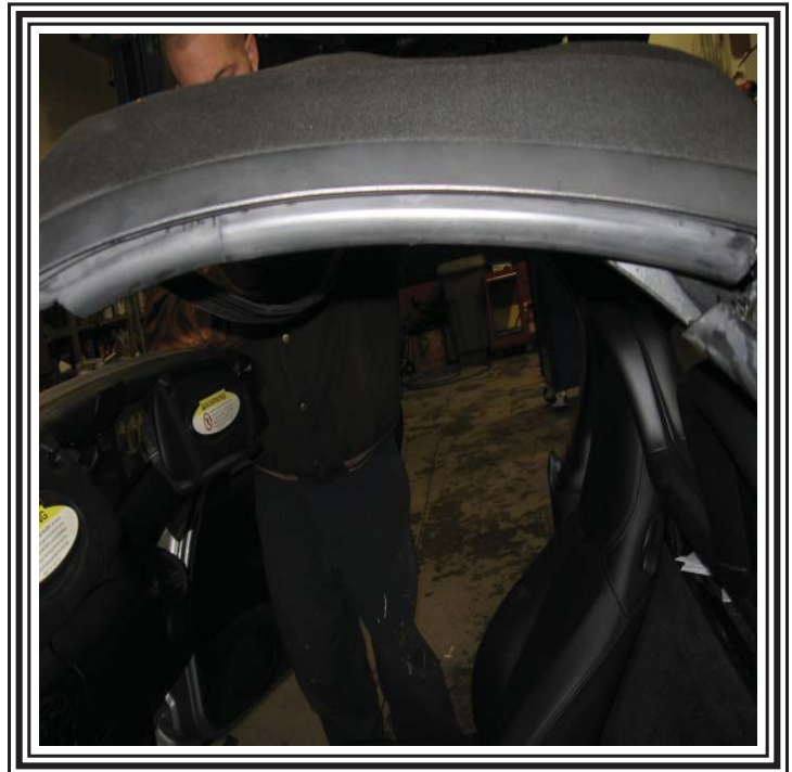
This shows what the weather strip looks like when it is locked in.