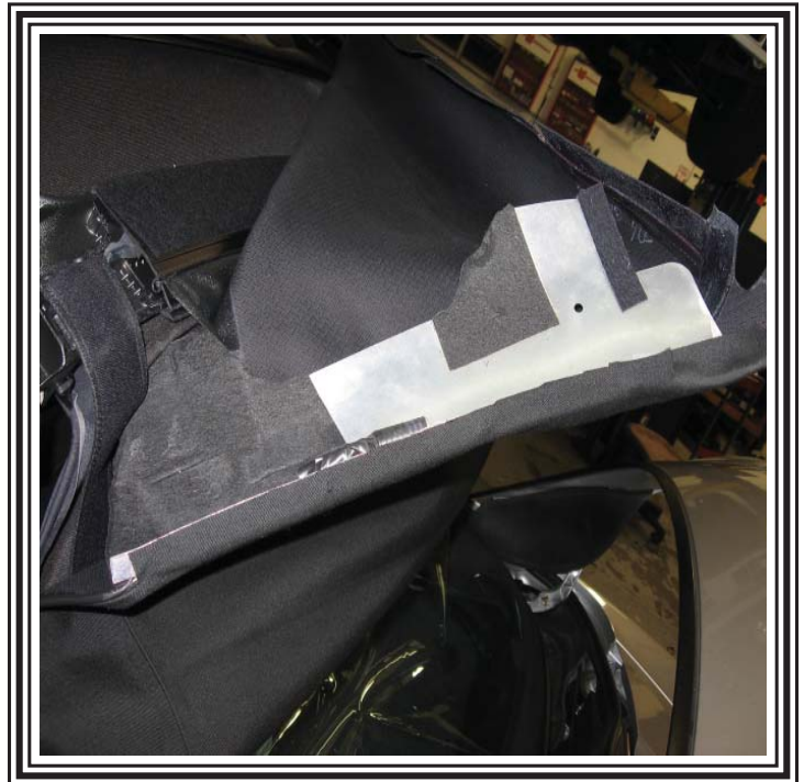
Then glue the top to the metal piece in front of the cable making sure that the holes in the top match up with the holes in the metal plate.