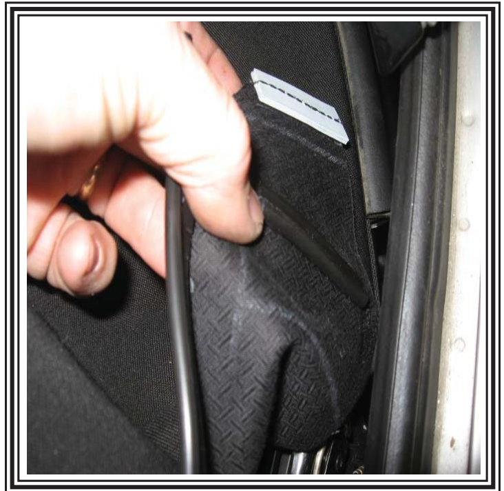
Take the rubber cord that is sewn into the top and lock that into the bottom of the quarter frame from rear to front.