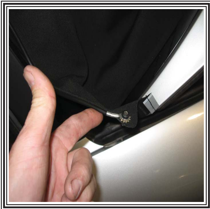
Screw into the material first to lock the cable into place.