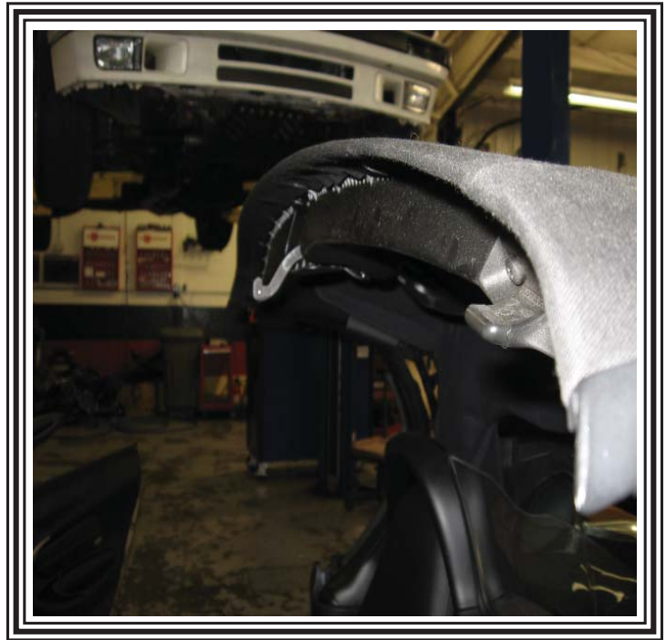
This picture shows the front of the top glued in place.