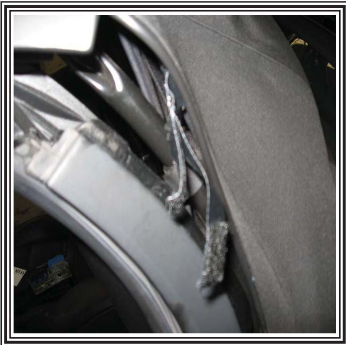
This picture shows the strap at the top of the quarter with velcro on both sides.