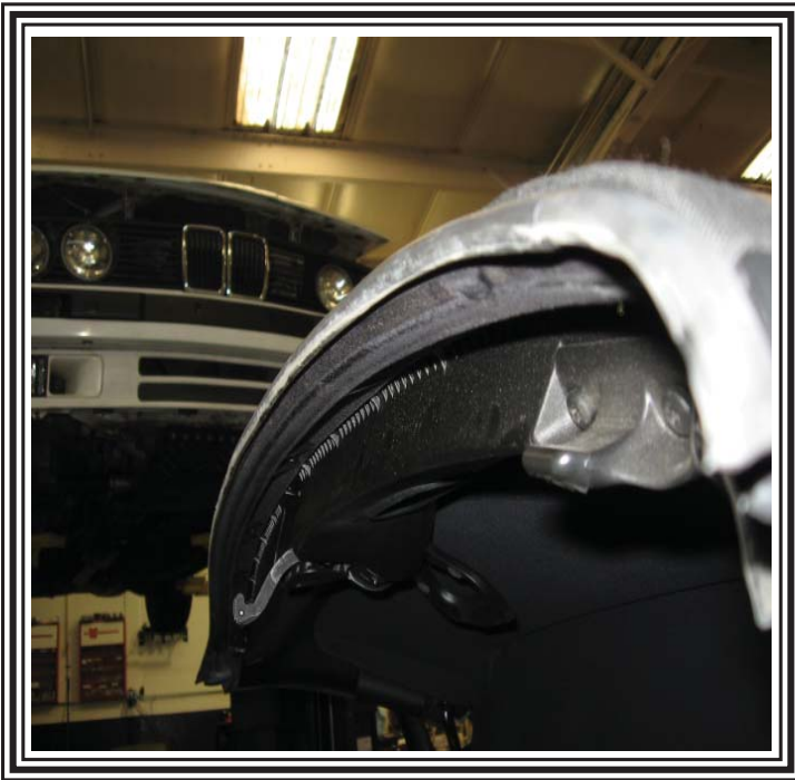
In this picture it shows where the weather strip mounts to the frame.