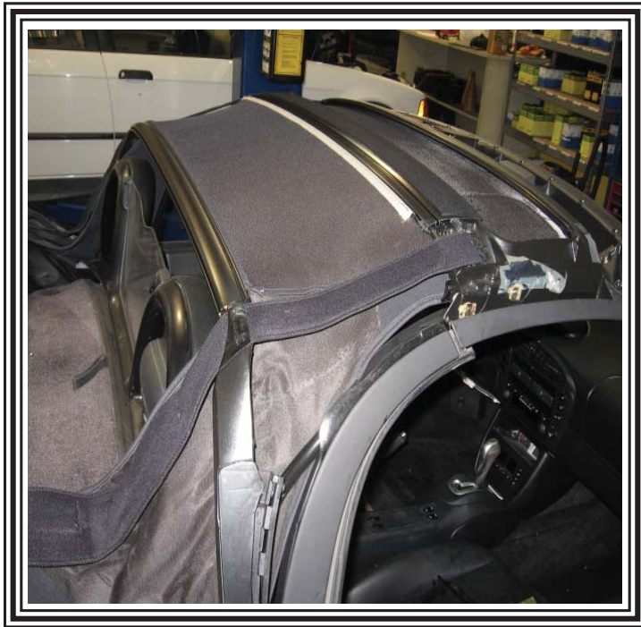
This is a picture of top completely off the car also a shot of the top of the headliner.