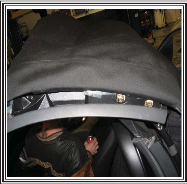
This is a picture of what the metal plate looks like glued on.