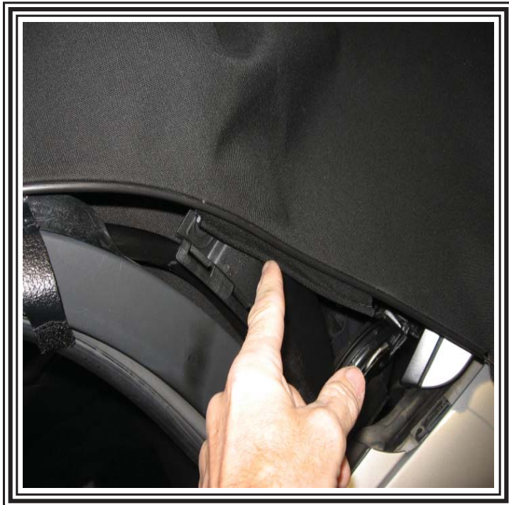
Take the quarter flap and slide it in the plastic extrusion in the quarter from top to bottom.