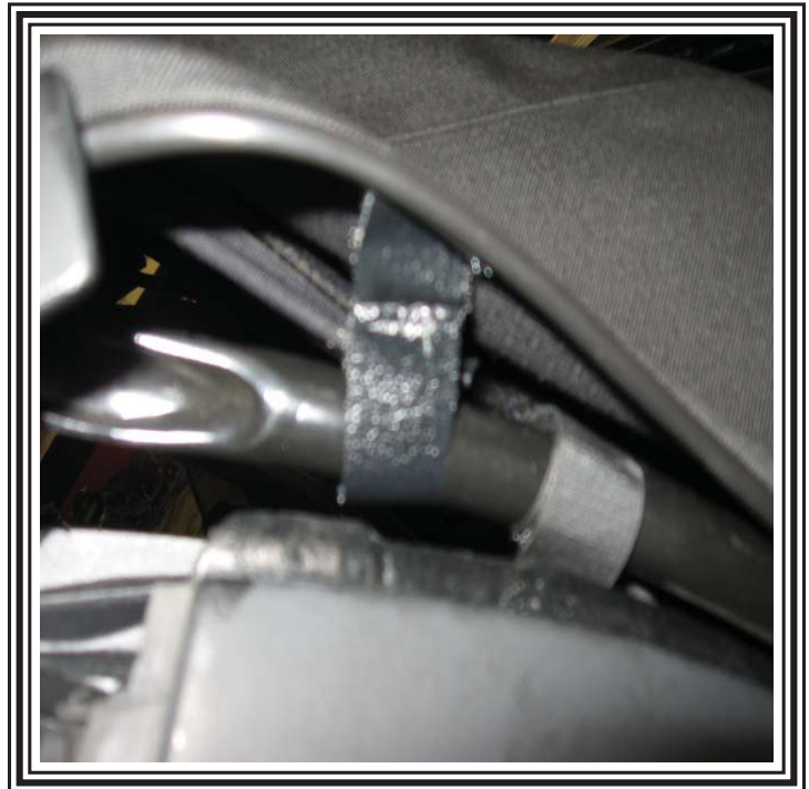
This picture shows the strap secured to the bar.