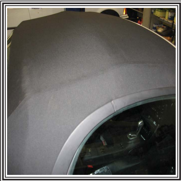
Another view, this one of the passenger side.