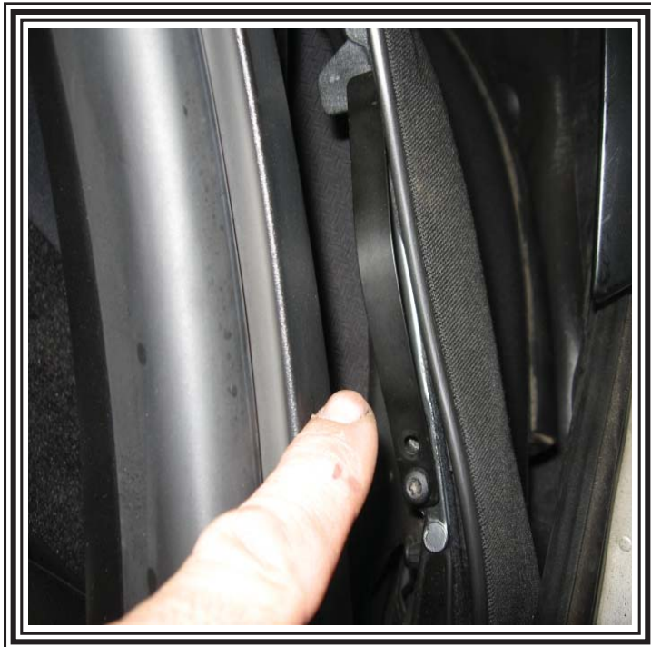
Take the plate you just bent and screw it down on the quarter. By bending the plate it keeps tension on the plastic piece as the top is coming forward.